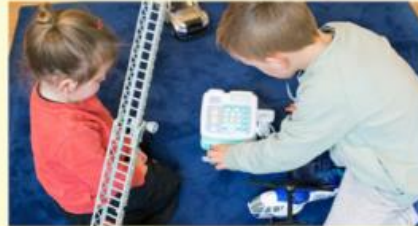
Sibling Therapy Sessions