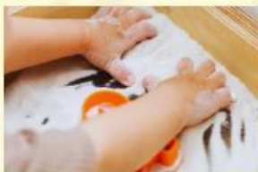
School Holiday Intensive Therapy