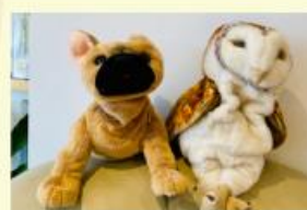
Calm The Guard Dog and Hear The Owl - Anxiety Workshop