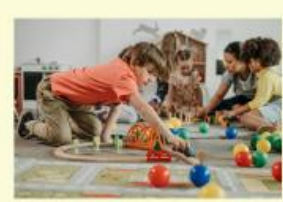
Group Play Therapy