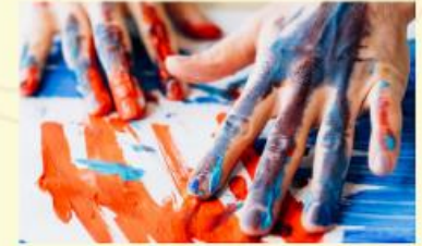
Arts Therapy for Adults