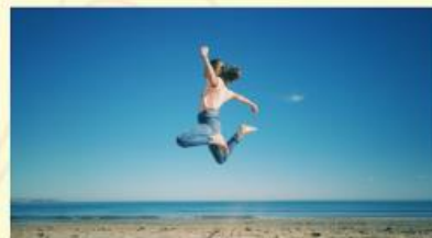
Self-E - 8 week Self-Esteem Workshop