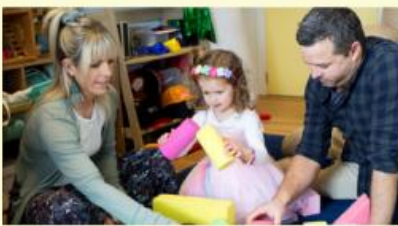
Interplay Therapy (Play Therapy involving child & caregiver)