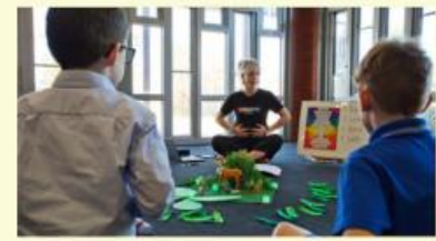
CD Kids - Expressive Social & Emotional Learning