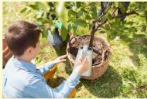
Therapeutic Horticulture (Garden Therapy)