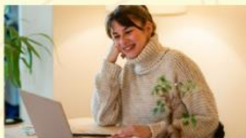
Caregiver Arts Therapy - Online Supportive Wellbeing Sessions