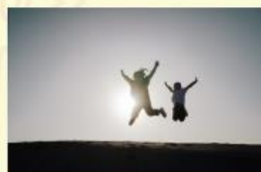
Self-E - 2 hour School Holiday Self-Esteem Workshop