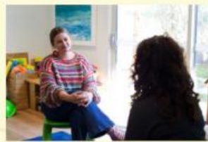
Caregiver Support Sessions