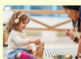
Safe and Sound Protocol (SSP)